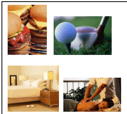
You pay with your products and services for...