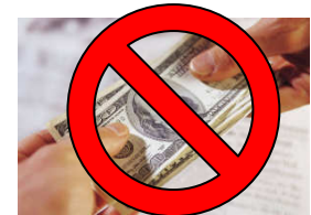
You don't pay