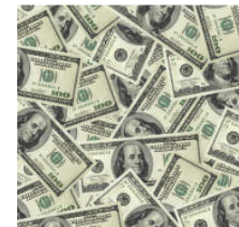
Preserving cash flow