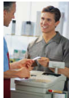
You get a customer