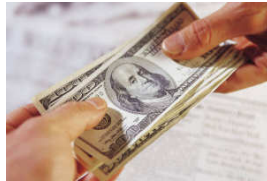
You pay cash for... ..non-income producing services/equipment