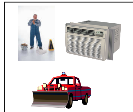
...non-income producing services/equipment