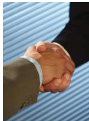
You contract for services