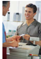
You may get a customer or... NOT